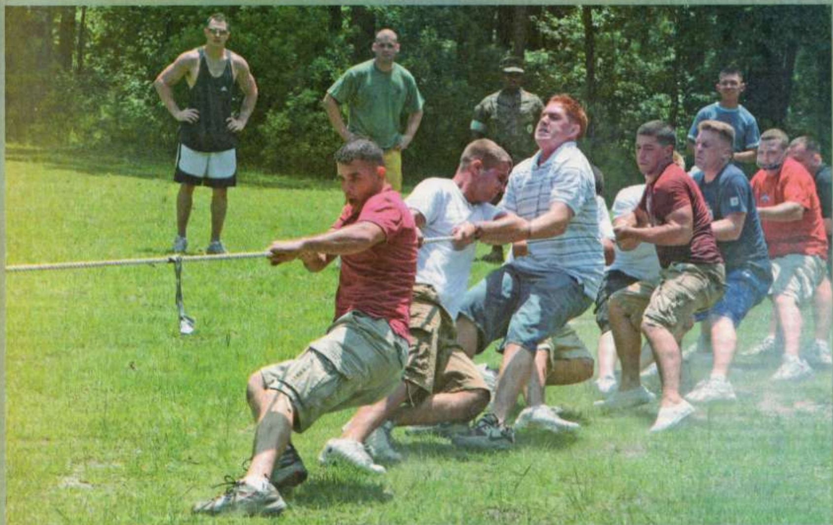
The tug of war pitted 10-man teams against one another at the Headquarters and Headquarters Squadron family day, June 8. The tug of war was just one of the many section competitions.